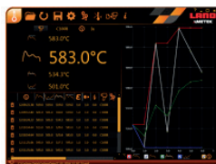
The Table View showing Instantaneous, Valley, Average and Peak, plus the unique Meltmaster temperature (on the 055 L model) readings.

The Trend View displays Peak, Instantaneous, Average and Valley temperatures, Logger settings, Route Manager, Background Correction plus Timed Logging (taking measurements at pre-defined intervals between 1 and 60 secs).