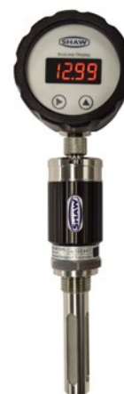
AcuDew shown with AcuLoop plug in display. AcuLoop sold separately.

The Model Acudew is supplied ready to use, with a Certificate of Calibration traceable to National and International Humidity Standards, instruction manual and two metres of cable.