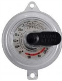
R3D LP Dial Sr. Tab

The ALTA Propane Level Monitor supports both Jr. and Sr. R3D Gauges. Monnit's level monitor does not support anything outside of this specification.