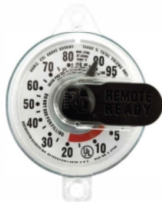
R3D LP Dial Jr. Tab