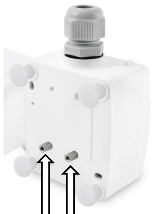
2 sensing parts (electrode extensions) under the WLD 24 unit for detection of water and moisture

More details about Water Detection Tape WDT in separate data sheet.