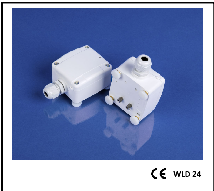
CE WLD 24