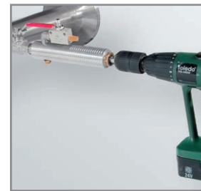
Drill under pressure with the CS drilling jig

3) Due to the large measuring range of the probe even extreme requirements to the consumption measurement (high volume flow in small pipe diameters) can be met.