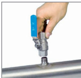
A Screw neck

By means of the drilling jig, it is possible to drill under pressure through the 1/2" ball valve into the existing pipe. The drilling chips are collected in a filter. Then install the probe as described under 1).