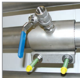
B Spot drilling collars